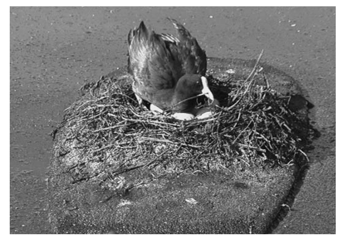
Bodyboard nesting islands ready for installation, photo by Arleone Dibben-Young.