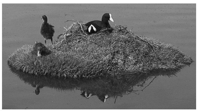
Hawaiian Coot and chicks on bodyboard island, photo by Arleone Dibben-Young.