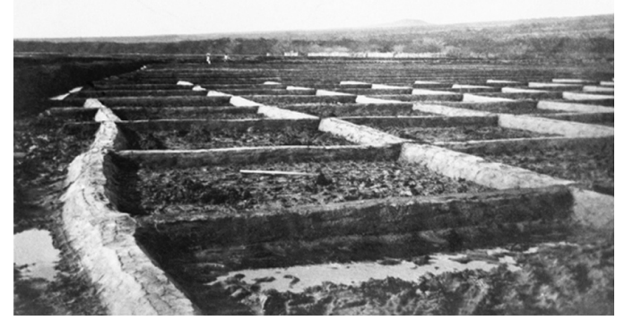
Kaunakakai saltworks 1901, photographer unknown.