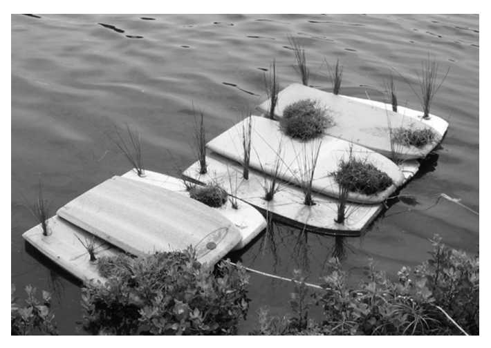
Hawaiian Coot on bodyboard island with eggs, photo by Arleone Dibben-Young.