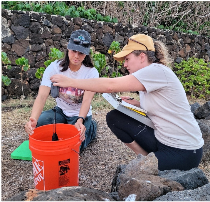
Figure 1. Hawai'i Pacific University students weigh 'ua'u kani chicks to study phenology, chick growth, and reproductive success.

We report on the ongoing monitoring and restoration efforts of the Freeman Seabird Preserve (FSP) by Hawai'i Audubon Society and Hawai'i Pacific University since 2009, share findings from the 2023 breeding season, and briefly discuss the plans for future monitoring, habitat restoration, and predator control at the site.